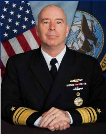
VICE ADMIRAL WILLIAM HOUSTON Commander, Submarine Forces