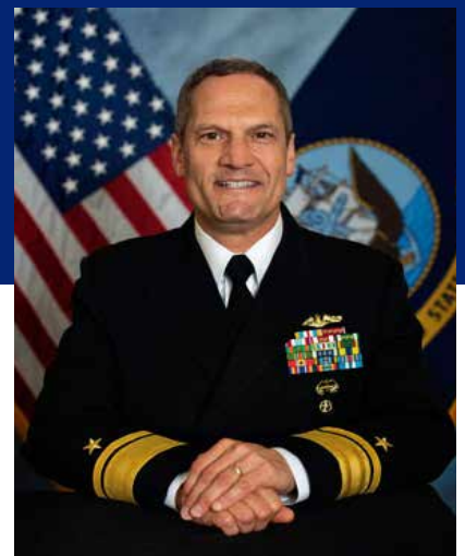
REAR ADMIRAL JEFFREY T. JABLON Commander, Submarine Force, U.S. Pacific Fleet