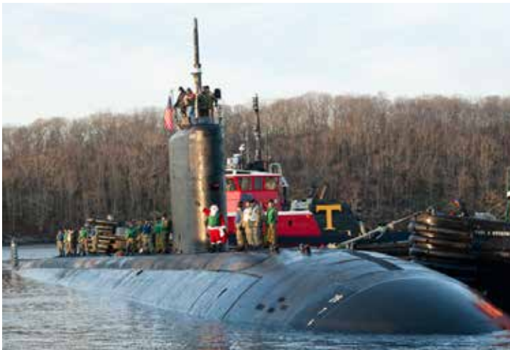
Santa waves to friends and family of the Los Angeles class submarine USS San Juan (SSN 751) as it returns to Submarine Base New London in Groton, Connecticut Friday, Dec. 17, 2021 following normal operations. San Juan is the third United States ship to be named San Juan and was commissioned on Aug. 6, 1988.