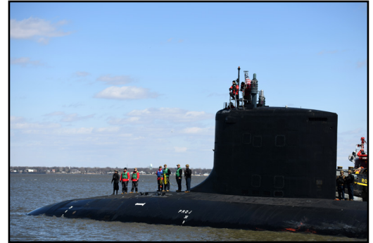
The Virginia-class submarine USS Delaware (SSN 791) is guided by a tugboat as it arrives in Wilmington, Delaware March 29, 2022. Delaware's 132-man crew transited to Wilmington to participate in week-long commemoration events in honor of the boat's commissioning ceremony.