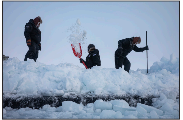
Members of Arctic Submarine Laboratory shovel snow in the Arctic to prepare the Virginia-class fast attack submarine USS Illinois (SSN 786) to free the boat's hatches from the ice during Ice Exercise (ICEX) 2022.