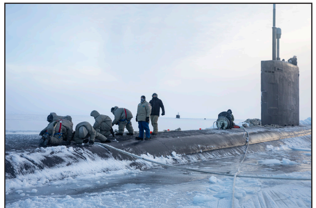
Sailors assigned to the Los Angeles-class fast attack submarine USS Pasadena (SSN 752) moor the boat to ice approximately 170 nautical miles offshore in the Arctic Ocean during Ice Exercise (ICEX) 2022.

a biennial exercise designed to provide realistic and effective training for participants using the premier training locations available throughout Alaska, ensuring the ability to rapidly deploy and operate in the Arctic. Arctic Edge takes place over the course of three weeks and will have approximately 1,000 participants, including U.S. and Canadian service members, U.S. Coast Guardsmen, and government employees from the U.S. Department of Defense and Canada's Department of National Defence.