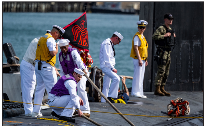
Sailors assigned to the Virginia-class fast-attack submarine USS Minnesota (SSN 783) heave mooring lines as the boat makes its homecoming arrival at Joint Base Pearl Harbor-Hickam after completing a change of homeport from Groton, Connecticut.