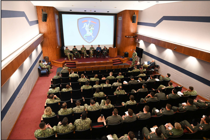
Flag officers speak with junior officers about undersea warfare during a Junior Officer Undersea Warfare Symposium and Training (JOUST) flag officer panel onboard Naval Support Activity (NSA) Hampton Roads.

Commander, Second Fleet and Commander, Submarine Force, U.S. Atlantic Fleet hosted a Junior Officer Undersea Symposium and Training (JOUST) event onboard Naval Support Activity Hampton Roads from April 25-29.