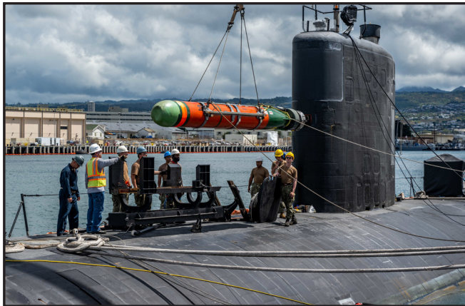
Sailors assigned to the Los Angeles-class fast-attack submarine USS Columbia (SSN 771) load a Mark 48 advanced capability torpedo for Exercise Agile Dagger 2021 (AD21).