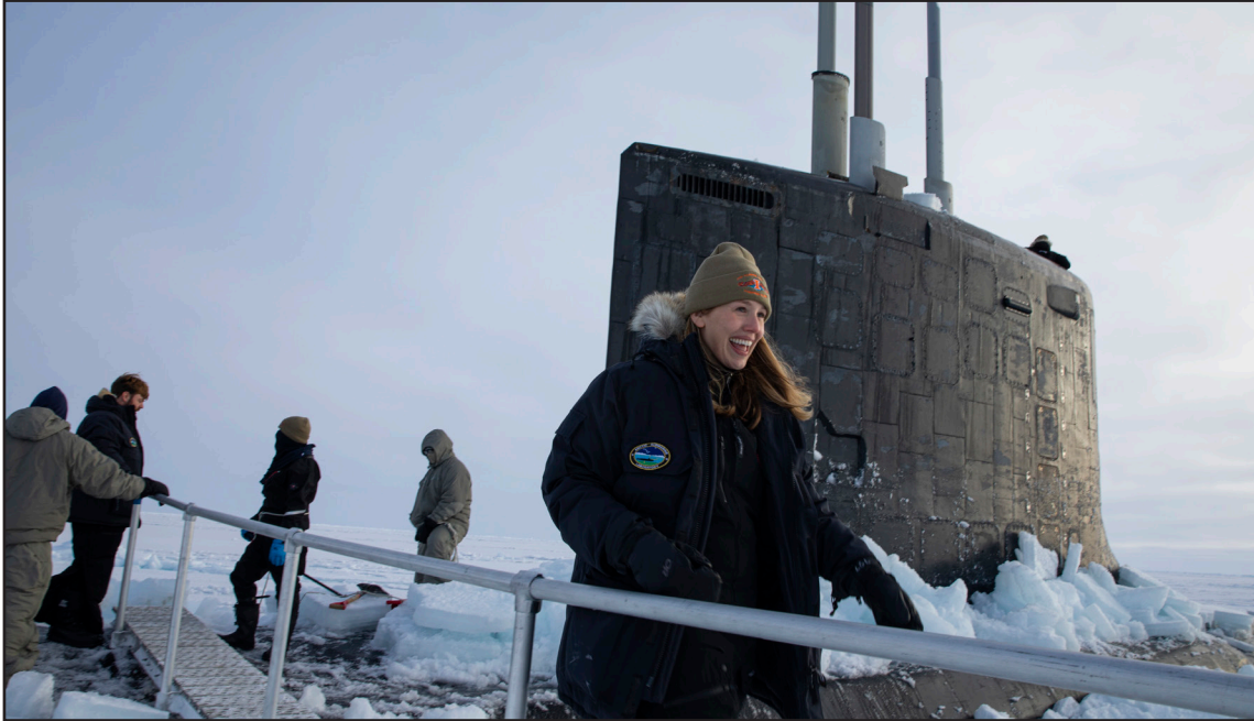
Meredith Berger, performing the duties of Under Secretary of the Navy, walks across the brow after visiting the Virginia-class fast attack submarine USS Illinois (SSN 786) during Ice Exercise (ICEX) 2022.

The U.S. Navy concluded its Ice Exercise (ICEX) 2022 March 17, wrapping up nearly three weeks of research and training on, above and below Arctic Ocean ice.