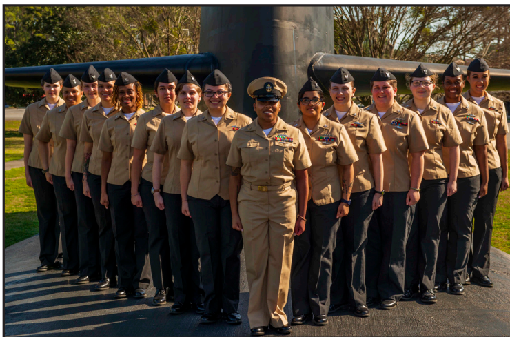
The enlisted women assigned to the Blue Crew of the Ohio-class ballistic-missile submarine USS Wyoming (SSBN 742).

"As I learn more about women's history, it brings me so much