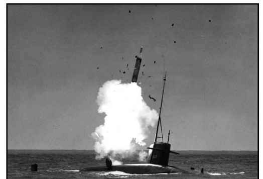
USS Henry Clay (SSBN 625) launches a Polaris Missile from the surface of the Atlantic Ocean off Cape Kennedy in 1964.