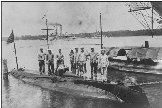
The crew of the USS Holland (SS-1) stands atop the submarine while moored at the U.S. Naval Academy in 1903.