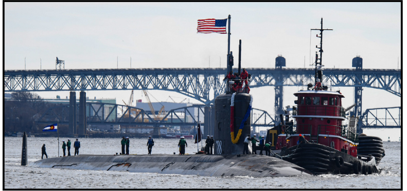
The Virginia-class fast attack submarine USS Colorado (SSN 788) is guided by a tug boat while returning home to Naval Submarine Base (SUBASE) New London.